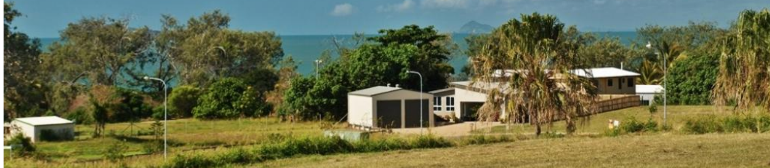
3 Timaru Place, Emu Park