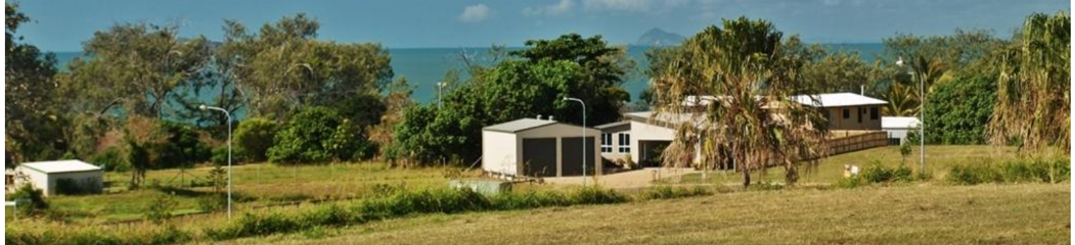
3 Timaru Place, Emu Park