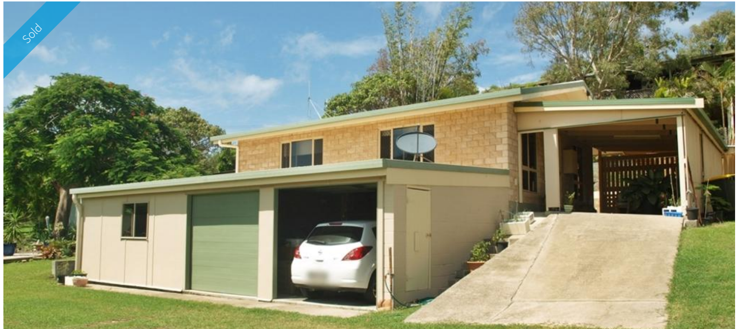
90b Archer Street, Emu Park