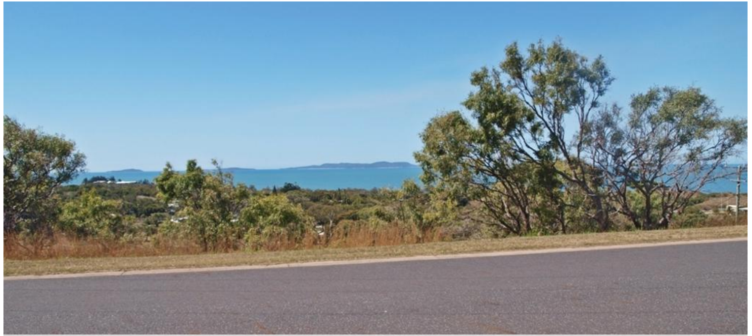
2 Hawke Street, Emu Park