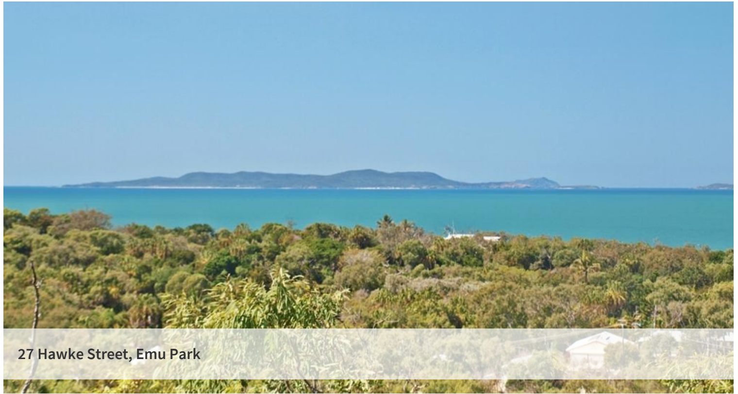
27 Hawke Street, Emu Park