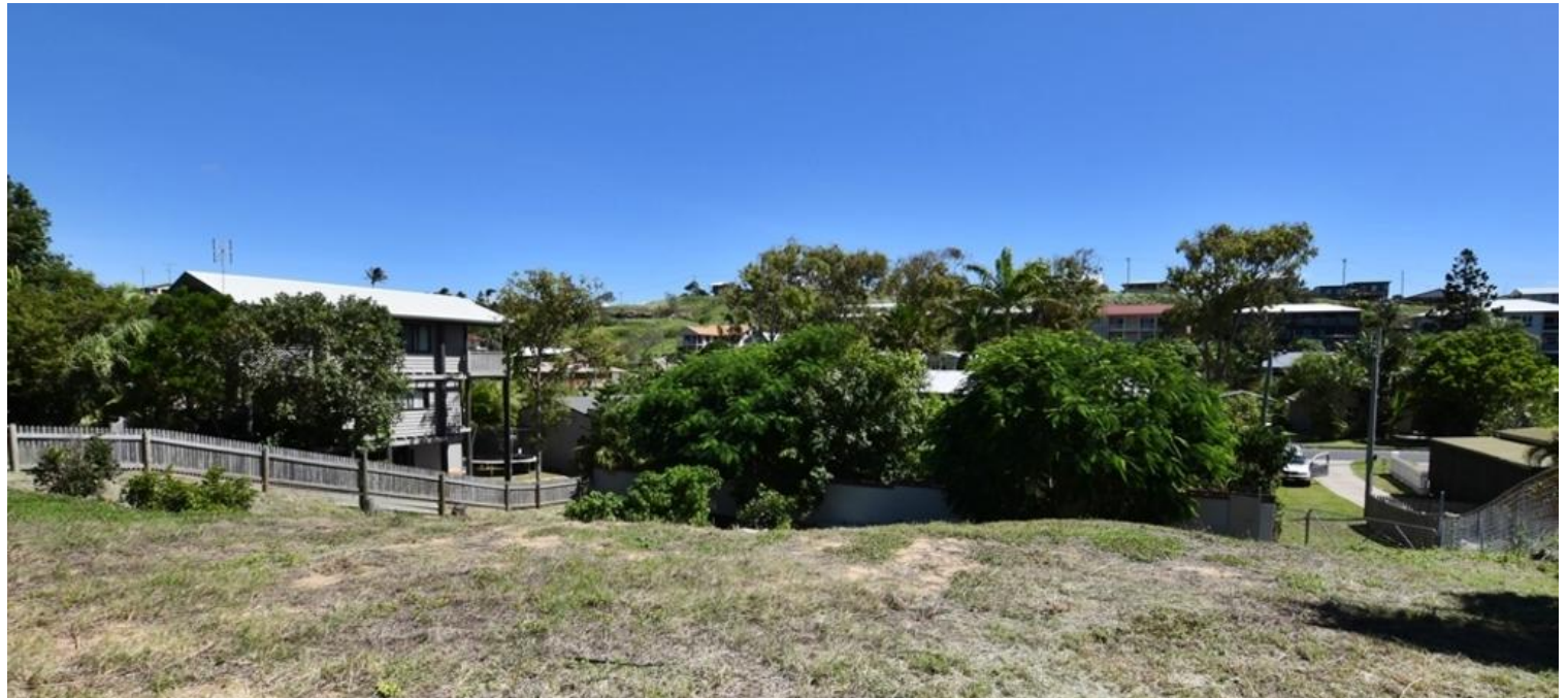
35 Ferguson Street, Emu Park