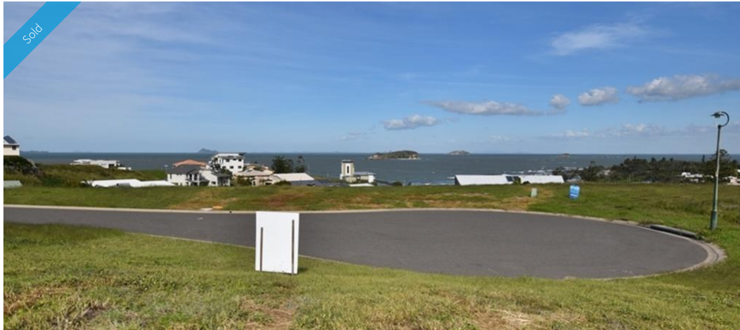
16 Haliotis Avenue, Zilzie