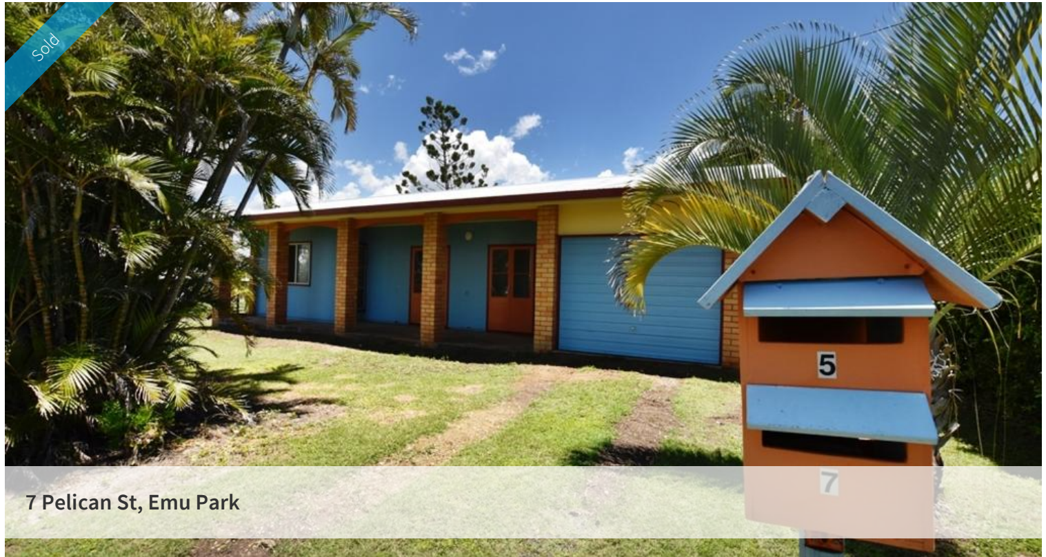
7 Pelican St, Emu Park