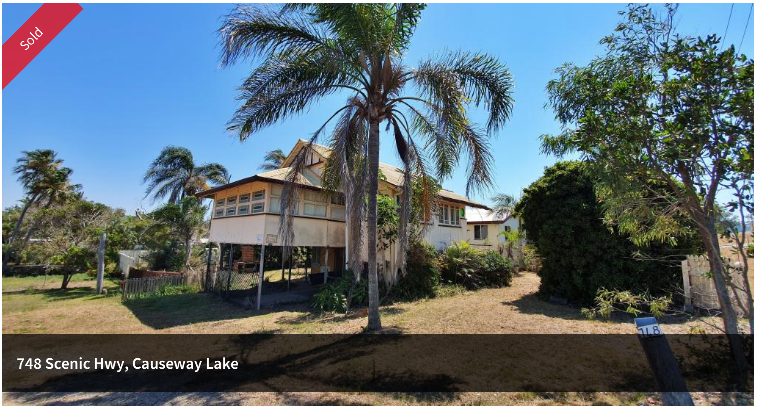
748 Scenic Hwy, Causeway Lake